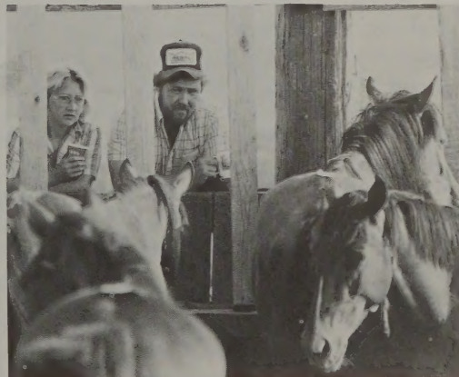
Prospective adopters look over the wild horses available for adoption during Tennessee Wild Horse and Burro Days.